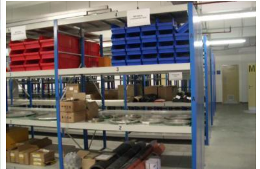
Link Misr Medium span