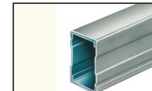
Box Extra Heavy Duty Beam (3LBC) For use with chipboard or steel shelf panels. Lengths range from 1050mm to 3000mm