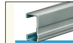
C Section Medium Duty Beam (2LSC) For use with chipboard or steel shelf panels. Lengths range from 1050mm to 1800