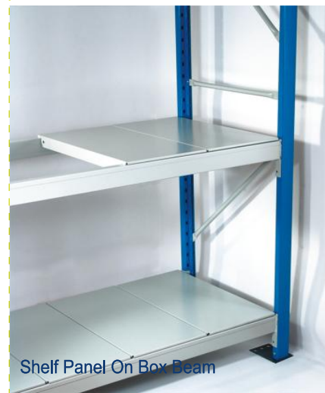
Shelf Panel On Box Beam