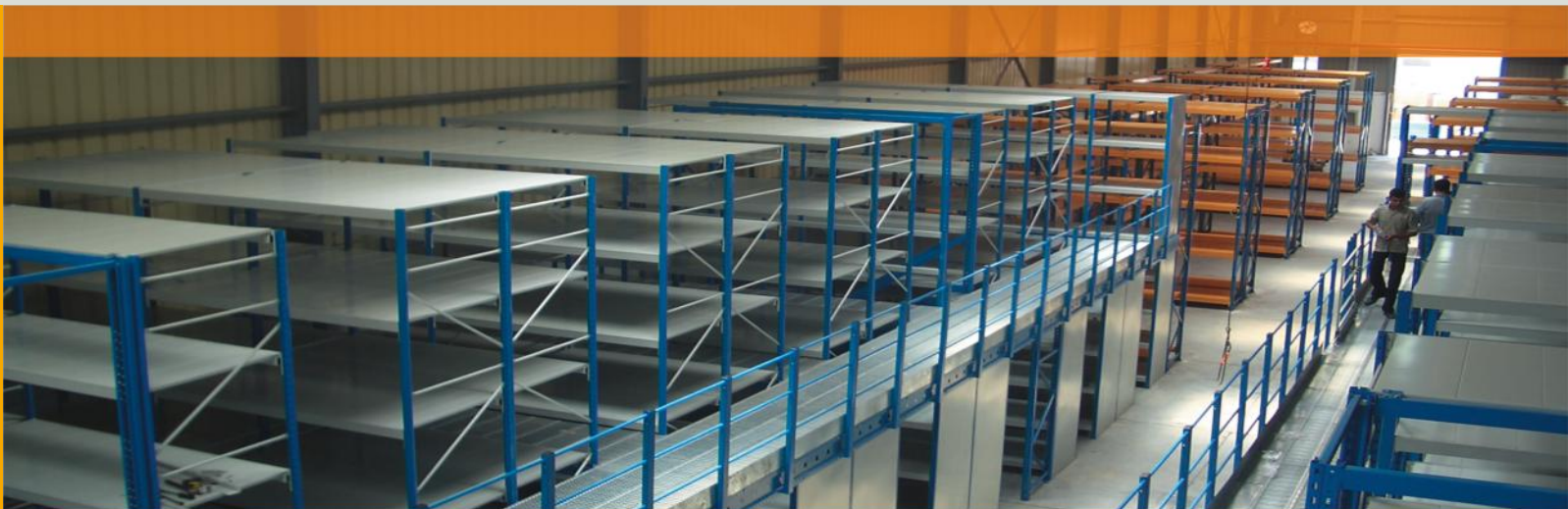
Versatile Clip-together Shelving