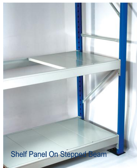
Shelf Panel On Stepped Beam