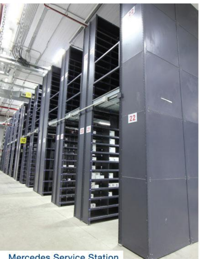
Mercedes Service Station