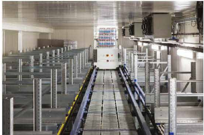
Satellite Storage System Using Automatic Automover