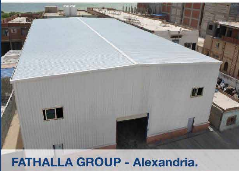
FATHALLA GROUP - Alexandria.

The result: a self-supporting warehouse which makes maximum use of available surface area, where storage can be manual, semi-automatic or fully automated. The structural design reviewed by our consultants inside Egypt and reviewed by Link51 UK outside.