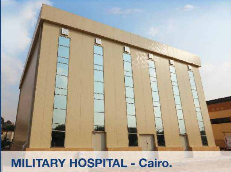
MILITARY HOSPITAL - Cairo.