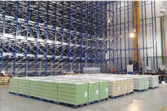
Satellite Storage System Using Automatic Pallet Crane