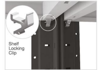
Shelf Locking Clip

For safety, this design helps prevent accidental shelf dislodgement