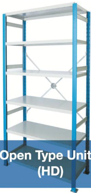
Open Type Units (HD)