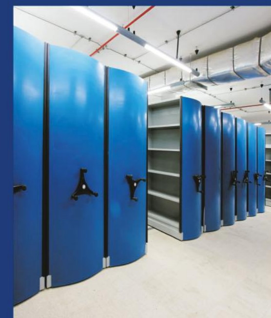
MD Mobile Shelving System