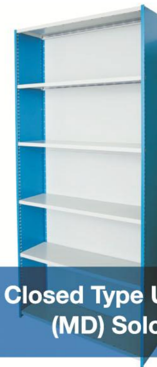
Closed Type Units (MD) Solo