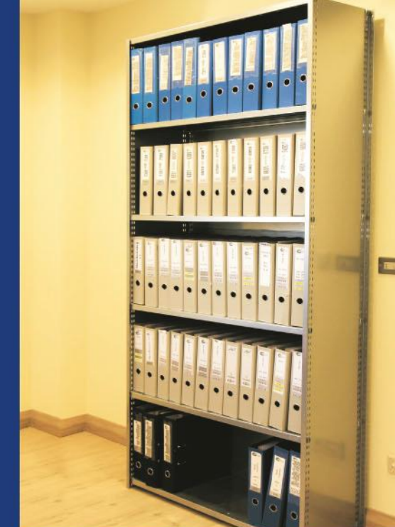
Solo Shelving Archiving System