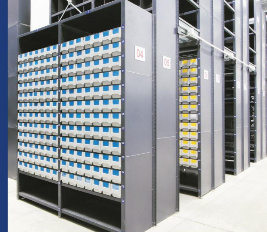
Plastic Drawers on HD Shelving System