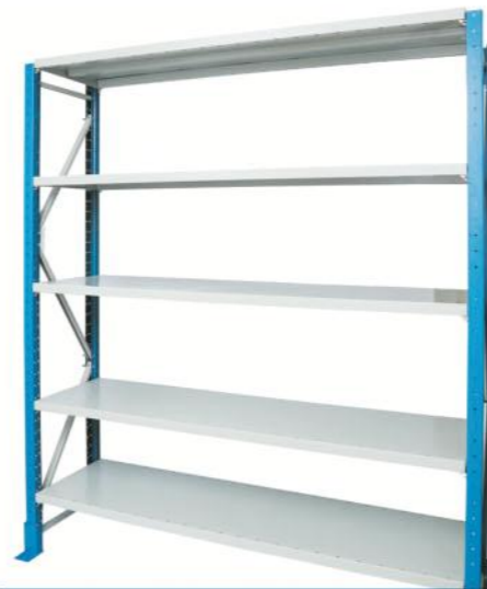
Open Beamless Medium Span (MS)