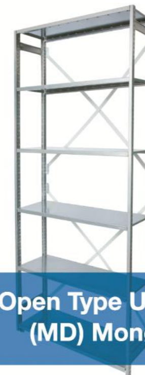
Open Type Units (MD) Mono