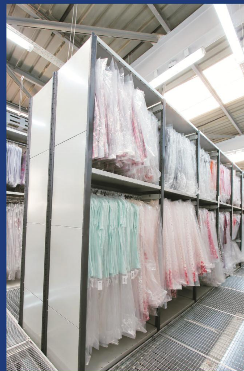
HD Garment Hanging System