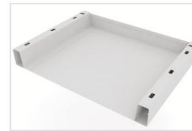
Box Section Shelf

Standard shelves will support loads of up to 200 kg. And when even that's not enough, there's the option to specify heavy or extra heavy duty for more demanding storage environment.