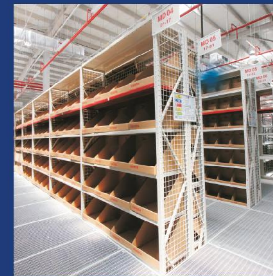
MS Shelving System Two Tiers

Shelving is manufactured under the control of quality management systems conforming to the international quality standards BS EN ISO 9001: 2008