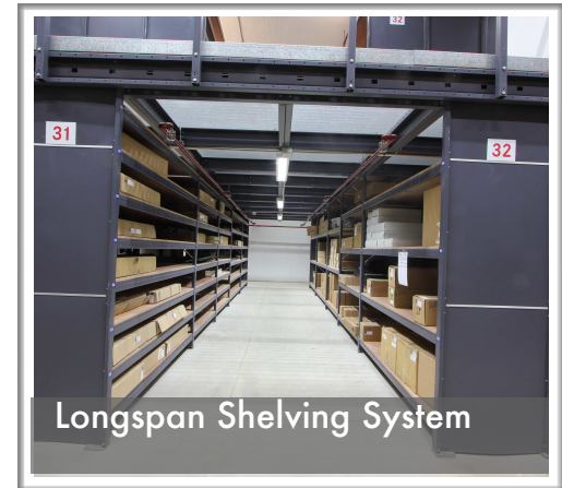
Longspan Shelving System