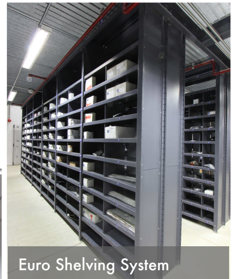
Euro Shelving System