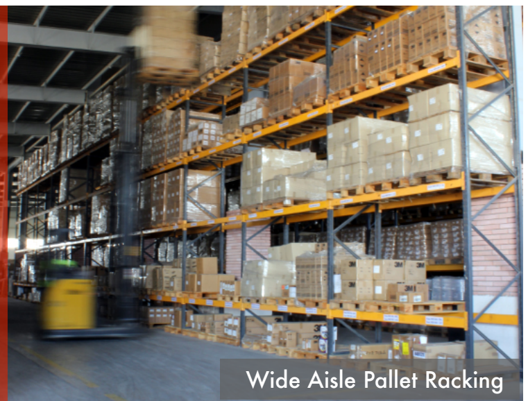
Wide Aisle Pallet Racking

On tackling the assignment, LinkMisr put into consideration all the client's requirements and adapted the product solutions accordingly. Given the nature of DHL's frame of work, it was essential that LinkMisr allocates the ideal solutions ensuring the utmost logistical features and benefits to DHL.