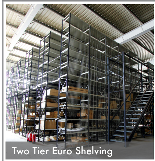
Two Tier Euro Shelving