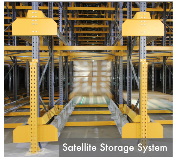
Satellite Storage System

Spreading over a vast area of 11,000 sqm , DHL's new warehouse gave room for growth, more flexibility and greater accessibility. However, the move required an efficient and swift disassembly of the existing racking system and moving it to the new location. Not only was the move efficient and seamless, it also proved the extreme durability of LinkMisr's products.